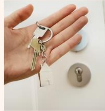
REAL ESTATE AND CONSTRUCTION